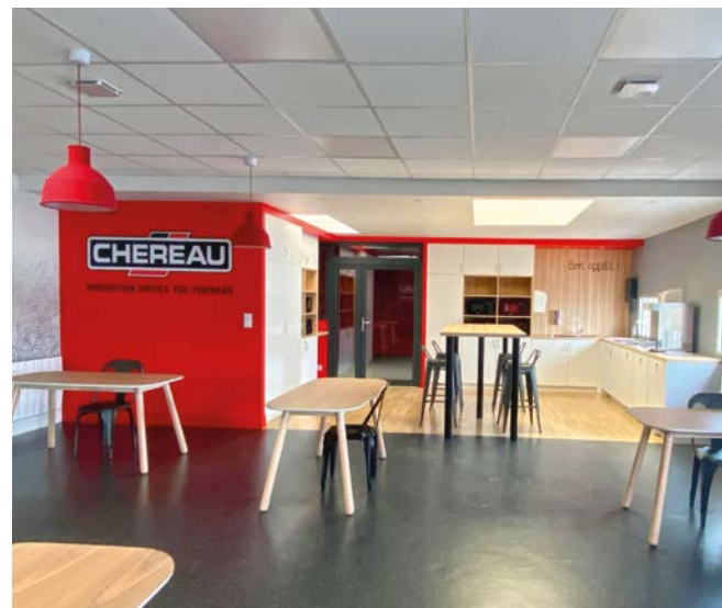
▲ Once again this year, many premises were refurbished for the well-being of the employees.

“Beyond winning the first edition of this competition, we are happy to be able to participate, at our level, in the reduction of waste, because the environment is an important subject for everyone. This competition is a good way to get all employees involved.”