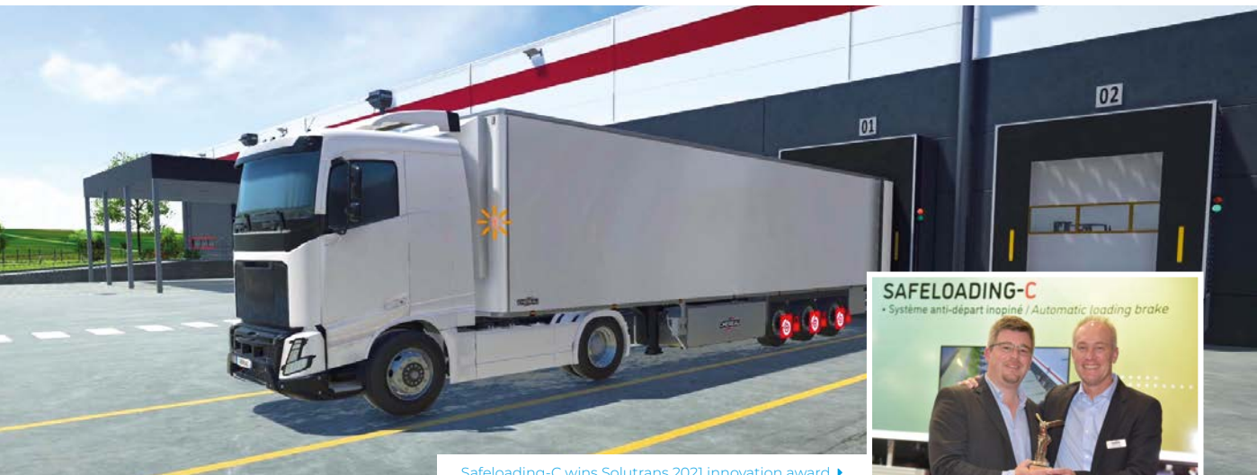
Safeloading-C wins Solutrans 2021 innovation award ▶

An innovation dedicated to the safety of dock operators who load and unload vehicles.