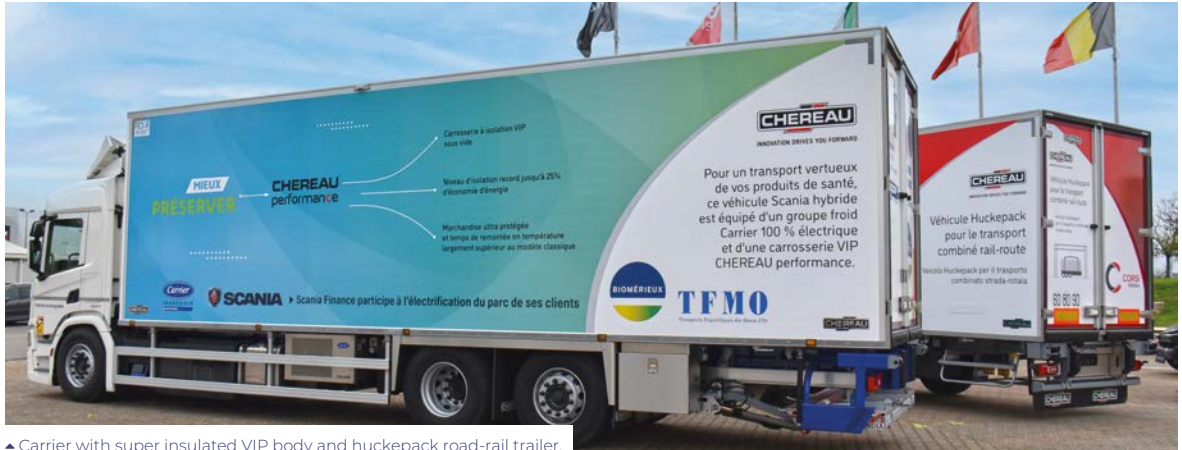
▲ Carrier with super insulated VIP body and huckepack road-rail trailer.