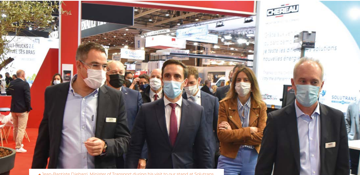
▲ Jean-Baptiste Djebbari, Minister of Transport during his visit to our stand at Solutrans.

The context of unprecedented increases in raw material costs has profoundly challenged our convictions and commitments.