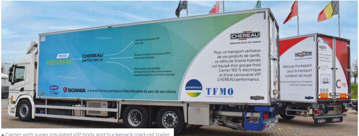
▲ Carrier with super insulated VIP body and huckepack road-rail trailer.