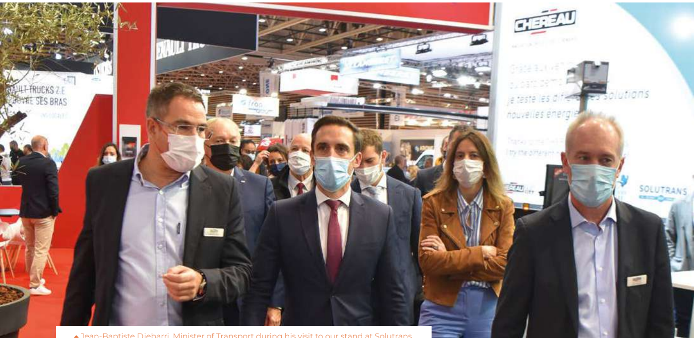
▲ Jean-Baptiste Djebbari, Minister of Transport during his visit to our stand at Solutrans.

The context of unprecedented increases in raw material costs has profoundly challenged our convictions and commitments.