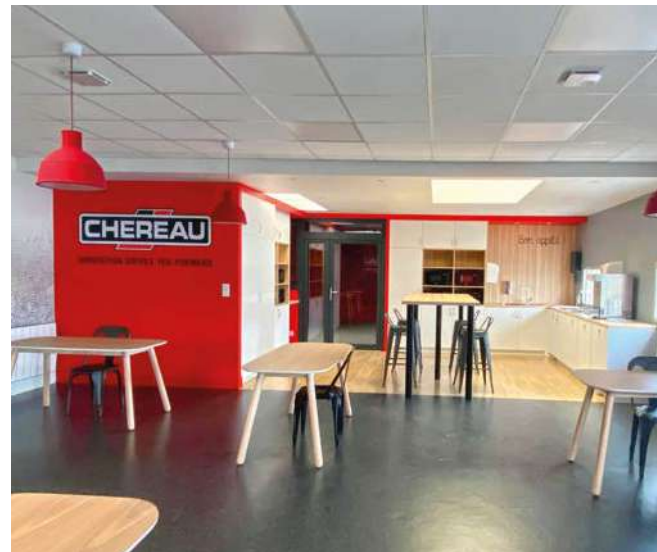
▲ Once again this year, many premises were refurbished for the well-being of the employees.

“Beyond winning the first edition of this competition, we are happy to be able to participate, at our level, in the reduction of waste, because the environment is an important subject for everyone. This competition is a good way to get all employees involved.”